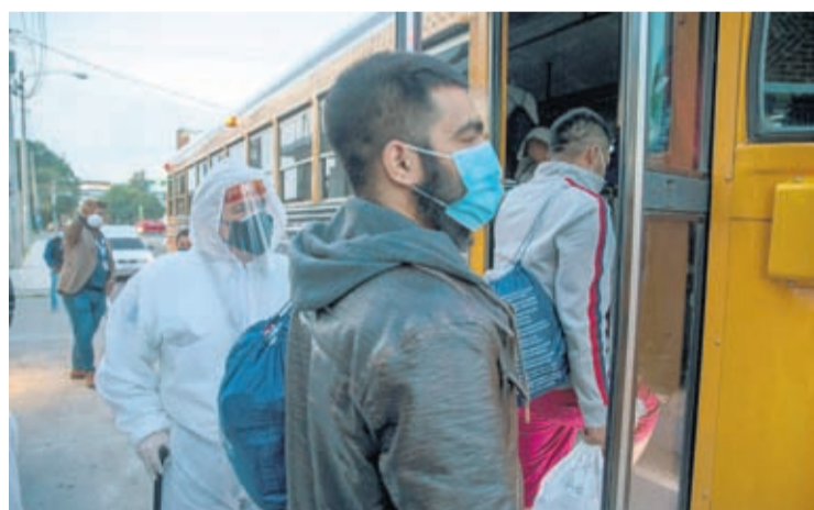
Guatemalans deported from the U.S., wearing a mask as a precaution against the spread of the new coronavirus, board a bus after arriving at La Aurora airport in Guatemala City, Tuesday, June 9, 2020.